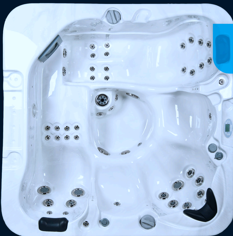
PANAMA DELUXE MODEL PICTURED